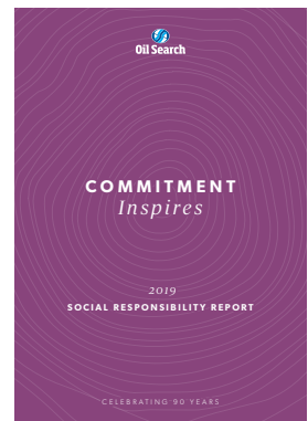
Social Responsibility Report

Enquiries and feedback on this reporting and performance are welcome. Please contact the Oil Search social responsibility team on: