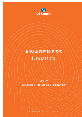
Preliminary Modern Slavery Statement