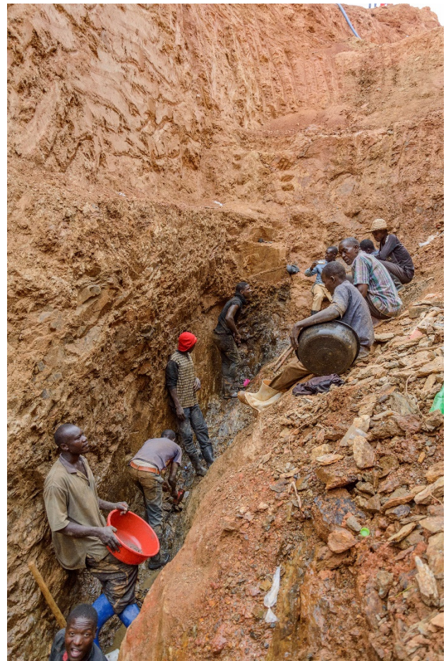
Project to combat child labour in gold mining, Busia, Uganda.

the EITI and the VPI, and to take an active role in these initiatives. Through the agreement, companies have raised the quality of their due diligence and the parties have initiated a joint project aimed at combating child labour in Busia, Uganda.