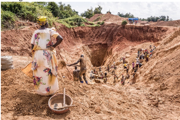
Gold mine in Busia, Uganda.

Lastly, the EU Conflict Minerals Regulation entered into force in the spring of 2017. It obliges EU importers to perform due diligence checks in line with the OECD Due Diligence Guidance for Responsible Supply Chains of Minerals from Conflict-Affected and High-Risk Areas, with the aim of curbing the use of trade in conflict minerals to finance armed groups, conflicts and human rights abuses. As a supplementary measure, the Dutch government proposed the European Partnership for Responsible Minerals 6 . The EPRM serves as a knowledge platform where organizations can share knowledge on due diligence. For instance, it provides support for the implementation of the OECD Due Diligence Guidance in Europe. EPRM also supports activities to improve the conditions in mining areas in conflict-affected and high-risk areas.